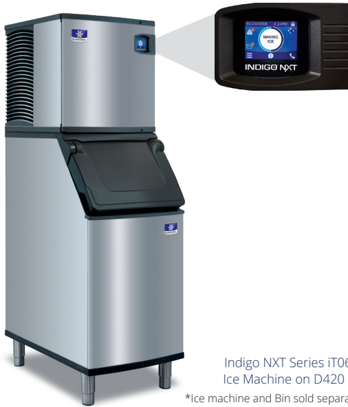
Indigo NXT Series iT0620 Ice Machine on D420 Bin